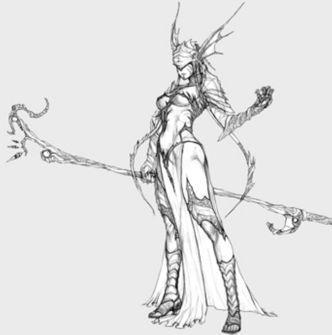
Aqua Mage Concept

Kalescent Studios specialises in bringing fantastic characters, creatures and their environments to life in traditional and digital mediums.