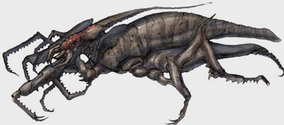
Dreg Beetle Concept